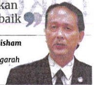
Dr Noor Hisham Abdullah, Ketua Pengarah Kesihatan

"Kita lihat trend dan jumlah lebih kematian hampir sama dengan WHO iaitu pada +7,692. Yang penting, ia menunjukkan trend negatif pada awal pandemik dan hanya meningkat apabila varian Delta meningkat pada pertengahan 2021.