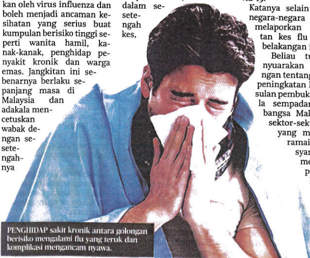
PENGHIDAP sakit kronik antara golongan berisiko mengalami flu yang teruk dan komplikasi mengancam nyawa.

Sementara itu, Dr Zulkifli berkata, flu boleh mengakibatkan kesan yang amat serius terhadap warga tua dan keluarga mereka. Ini boleh berlaku apabila ibu bapa yang sudah berusia dimasukkan ke hospital dan anak-anak terpaksa menanggung kos rawatan.