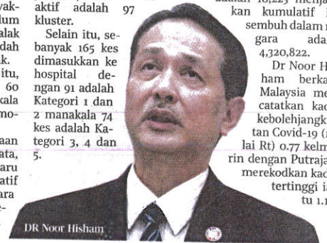
DR NOOR HISHAM

Dr Noor Hisham berkata, Malaysia mencatatkan kadar kebolehhajjatan Covid-19 (nilai Rt) 0.77 kelmarin dengan Putrajaya merekodkan kadar tertinggi iaitu 1.15.