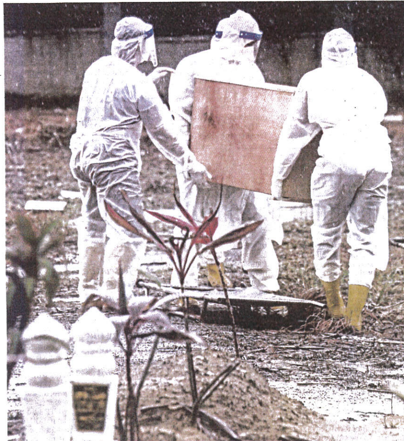
Undertakers in personal protective equipment burying a Covid-19 victim at the Setali Muslim cemetery in Kuantan in February this year. FILE PIC