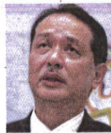
Tan Sri Dr Noor Hisham Abdullah

Most of the patients, 99.4 per cent or 3,982 people of the total cases, were in Categories 1 and 2, while the remaining 0.6 per cent (24 patients) were in Categories 3 to 5.